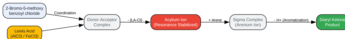
Figure 1: Mechanistic Pathway (Acylium Formation)[3]

Click to download full resolution via product page