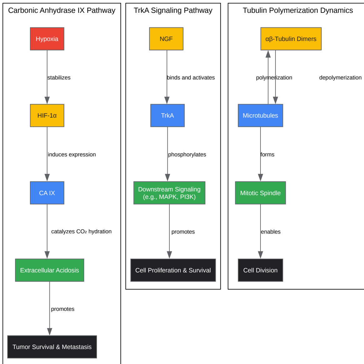
Figure 1: Simplified Signaling Pathways

Click to download full resolution via product page