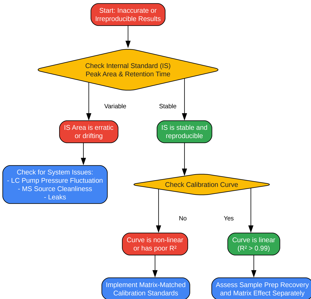
Troubleshooting Common LC-MS/MS Issues

Click to download full resolution via product page