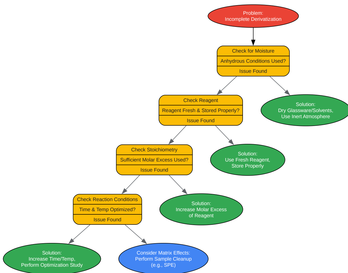
Diagram 3: Troubleshooting Logic for Incomplete Derivatization

Click to download full resolution via product page