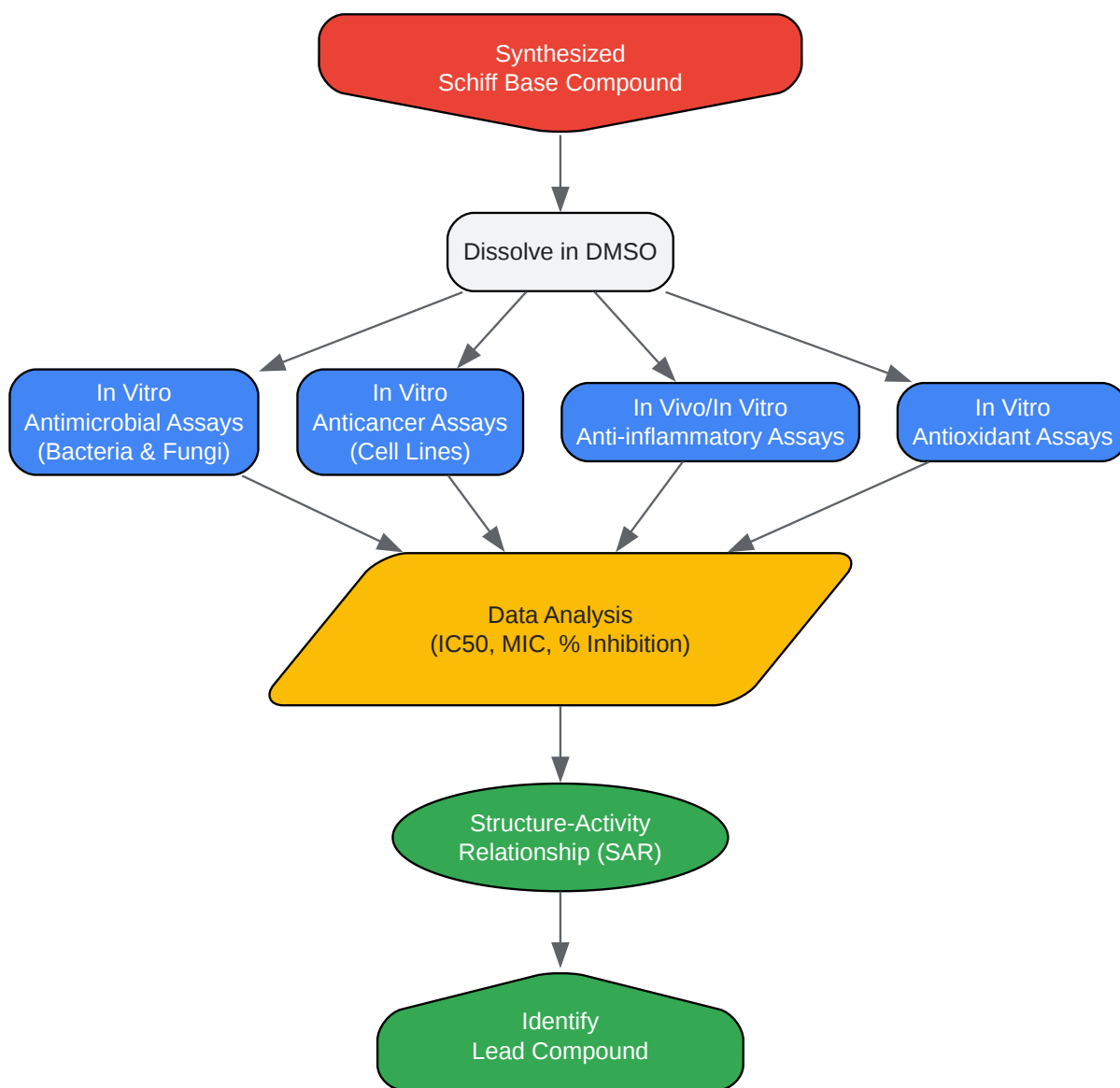
Workflow for Biological Evaluation

Click to download full resolution via product page