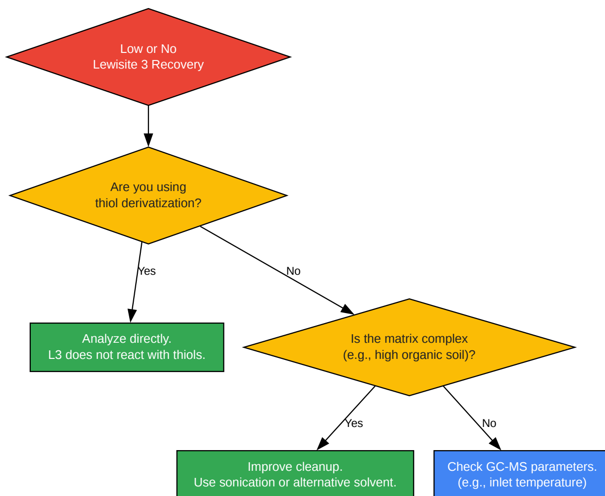
Caption: Environmental hydrolysis pathway of Lewisite 1.

Click to download full resolution via product page