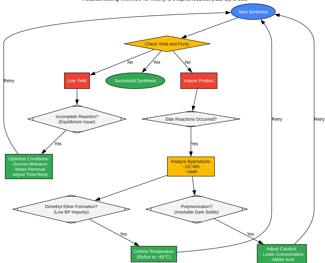
Troubleshooting Workflow for Methyl 3-thiophenecarboxylate Synthesis

Click to download full resolution via product page