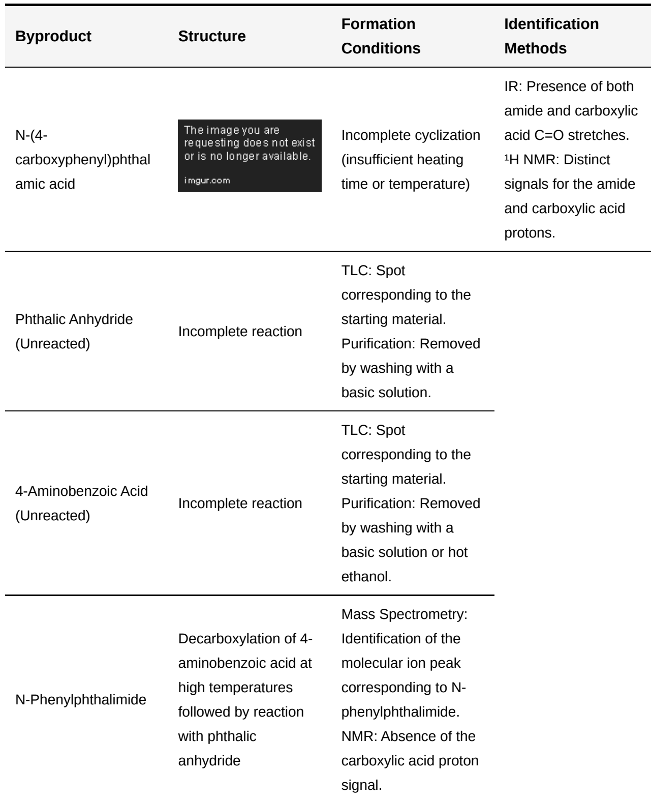
Table 1: Summary of Potential Byproducts and Their Identification