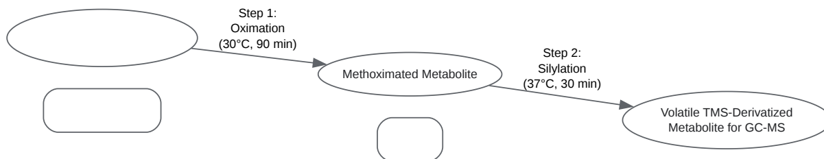
Diagram 2: Two-Step Derivatization Reaction

Click to download full resolution via product page