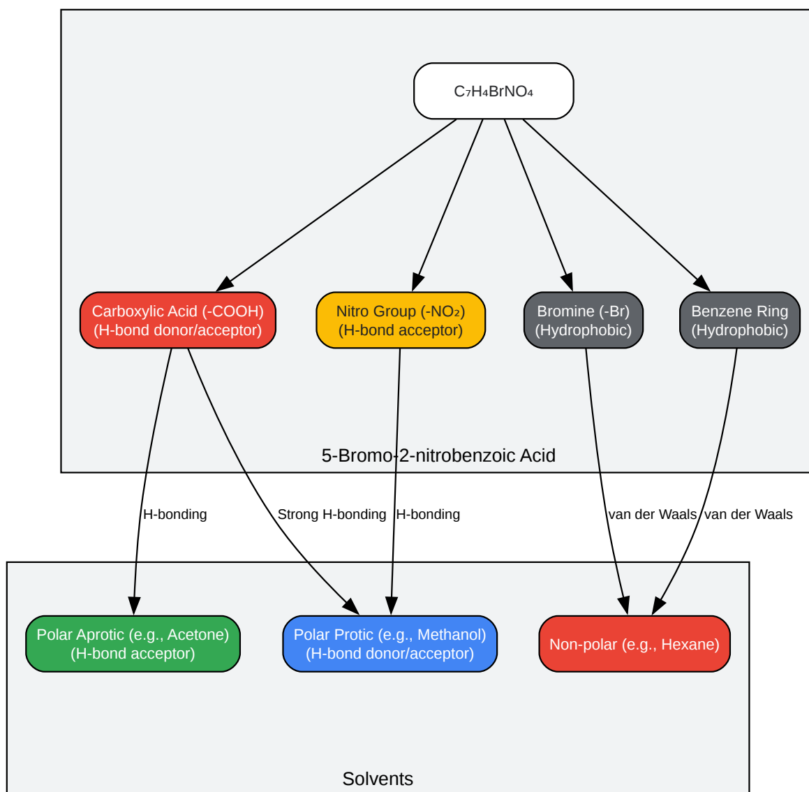
Figure 1: Intermolecular Interactions of 5-Bromo-2-nitrobenzoic Acid

Click to download full resolution via product page