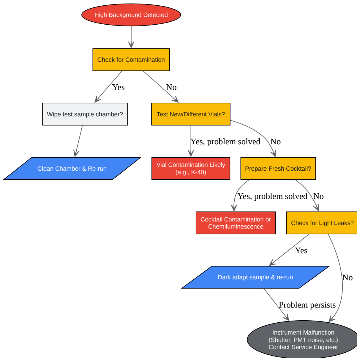
Diagram 2: Troubleshooting High Background Counts

Click to download full resolution via product page