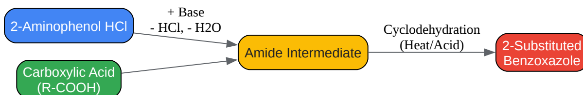
Figure 2: Synthetic Pathway for Benzoxazole Formation

Click to download full resolution via product page