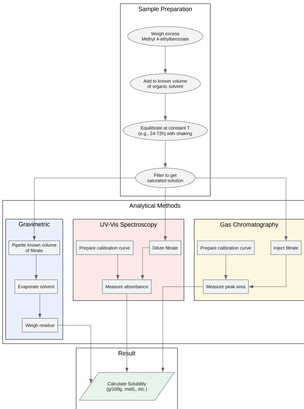
Experimental Workflow for Solubility Determination

To aid in the practical application of these methodologies, the following diagrams illustrate the experimental workflow and the underlying logic of solubility.