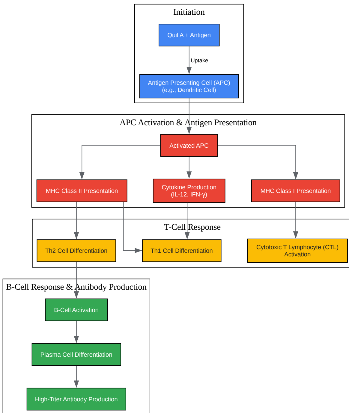
Caption: Experimental workflow for rabbit antibody production using Quil A .

Click to download full resolution via product page