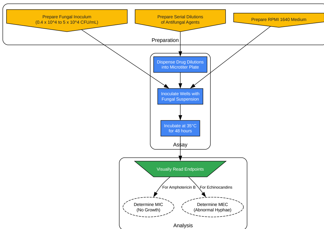
Figure 2: CLSI M38-A2 Workflow

Click to download full resolution via product page