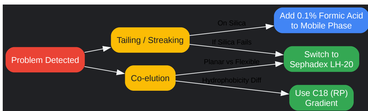
Figure 2: Troubleshooting Decision Matrix for Fraction Optimization.

Click to download full resolution via product page