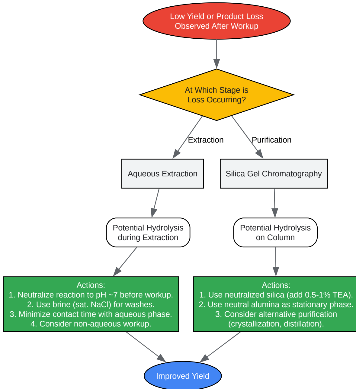
Fig. 2: Troubleshooting Product Loss During Workup

Click to download full resolution via product page