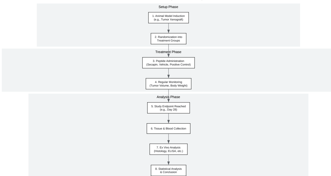
Generalized In Vivo Efficacy Workflow for Secapin