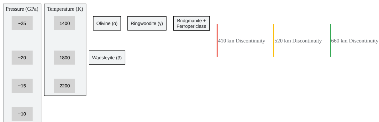
Simplified P-T Phase Diagram for (Mg,Fe) 2 SiO 4