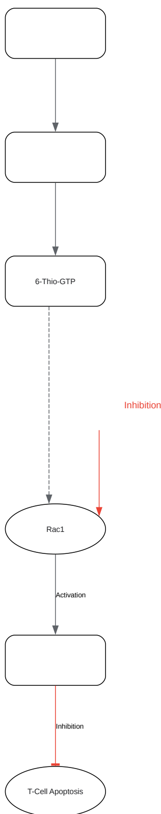
Figure 2: Azathioprine's Modulation of T-Cell Apoptosis via Rac1 Signaling

Click to download full resolution via product page