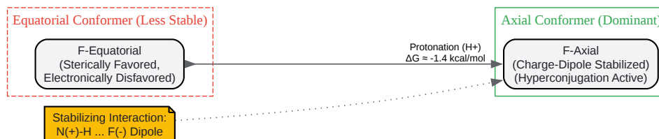
Figure 1: Protonation drives the equilibrium toward the axial-F conformer due to electrostatic stabilization.

Click to download full resolution via product page