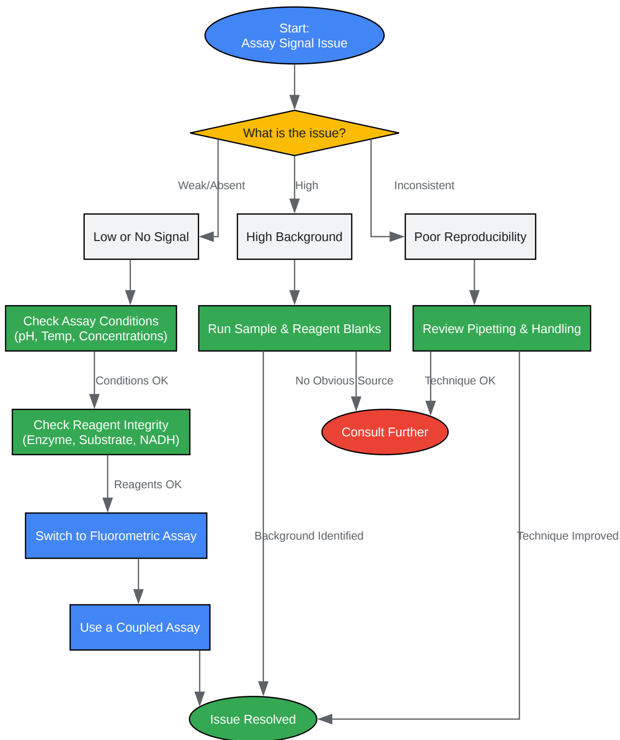
HADH Assay Troubleshooting Workflow

Click to download full resolution via product page