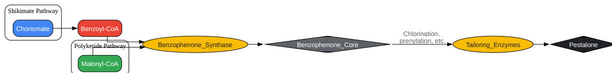
Diagram 1: Proposed Biosynthetic Pathway of Pestalone 's Benzophenone Core

Click to download full resolution via product page