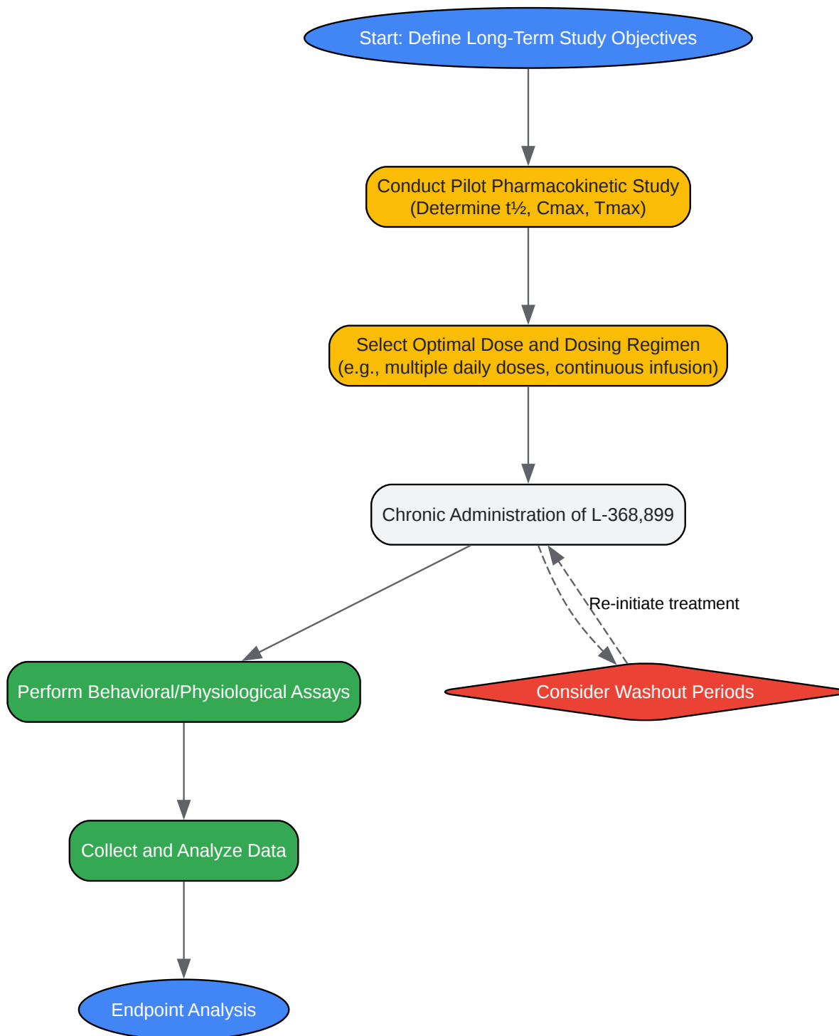
Caption: Oxytocin signaling pathway and the inhibitory action of L-368,899 .

Click to download full resolution via product page