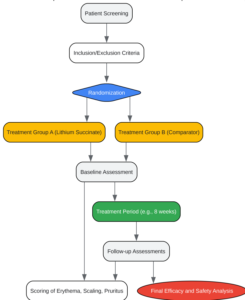
Figure 2: Generalized Experimental Workflow for a Clinical Trial of Topical Anti-Inflammatory Agents

Click to download full resolution via product page