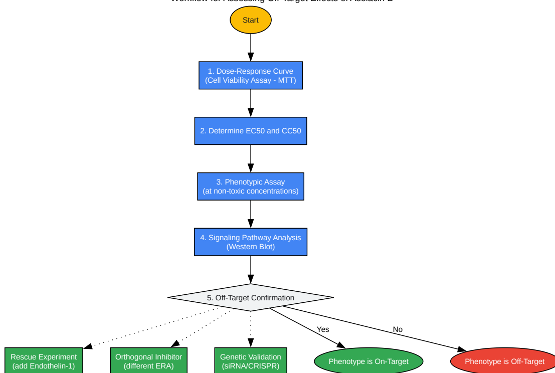
Workflow for Assessing Off-Target Effects of Aselacin B