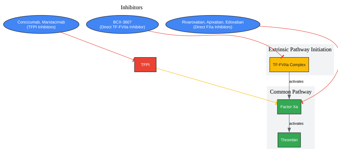
Diagram 2: Comparative Mechanisms of Action of Anticoagulants

Click to download full resolution via product page