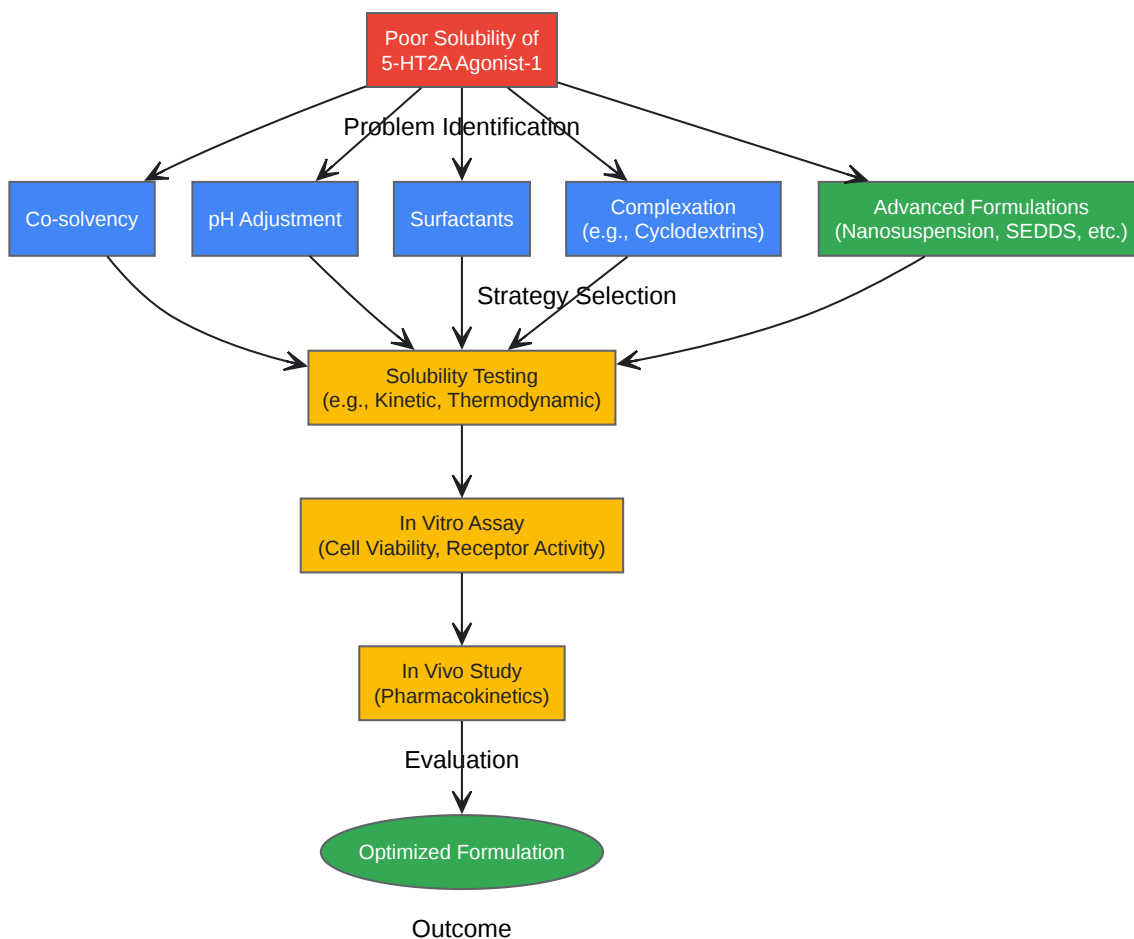
Figure 2: Workflow for Overcoming Poor Solubility

Click to download full resolution via product page