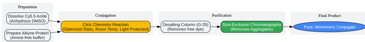
Caption: Troubleshooting workflow for Cy5.5 azide conjugate aggregation.

Click to download full resolution via product page