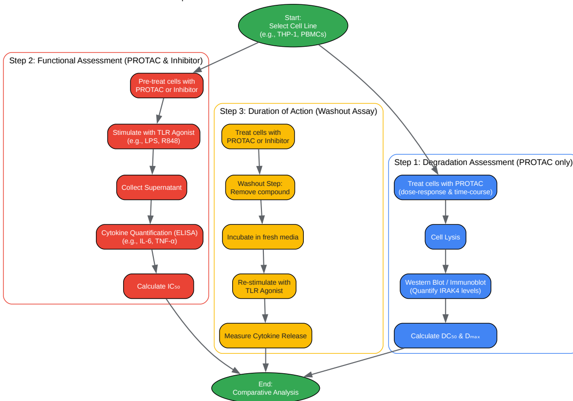
Experimental Workflow for PROTAC vs. Inhibitor Characterization

Click to download full resolution via product page