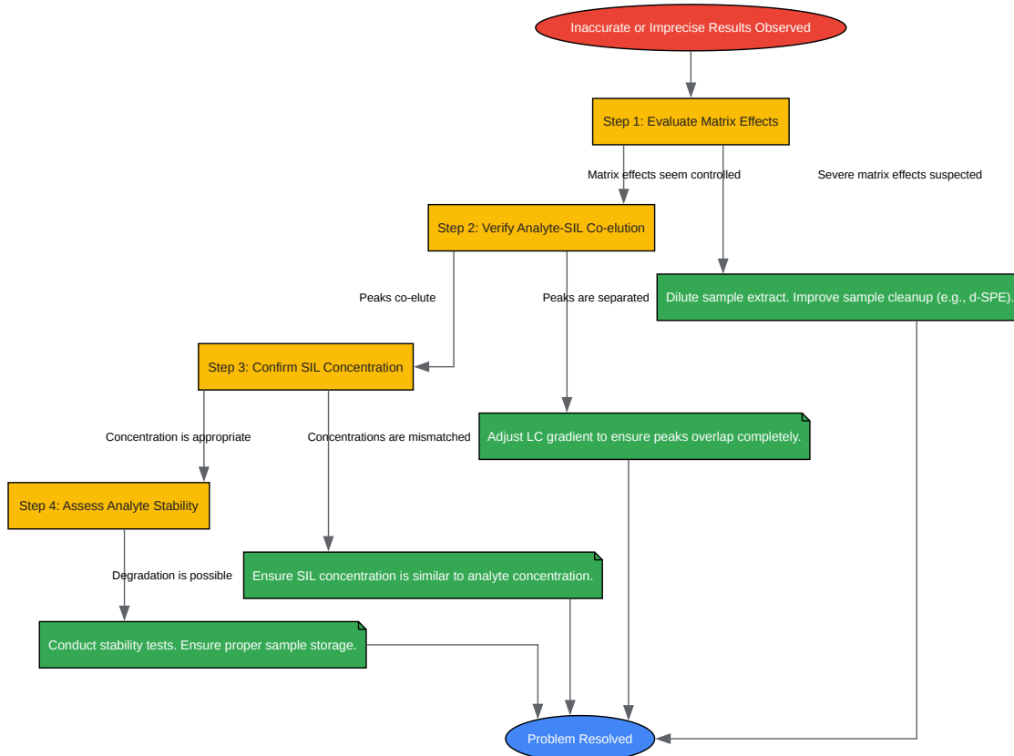
Workflow for Addressing Inaccurate Results with SIL Standard

Click to download full resolution via product page