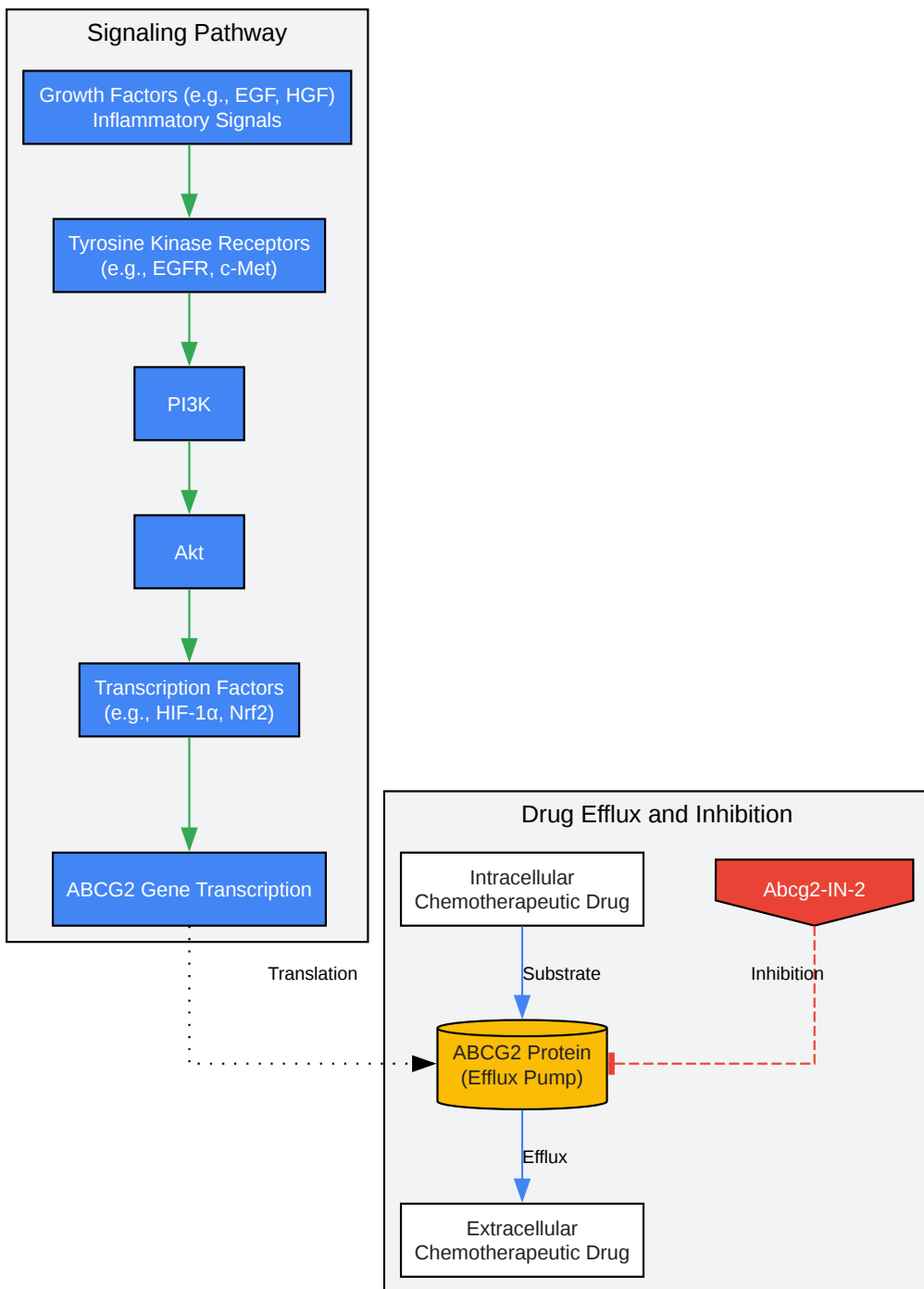
Simplified ABCG2 Regulation and Inhibition Workflow