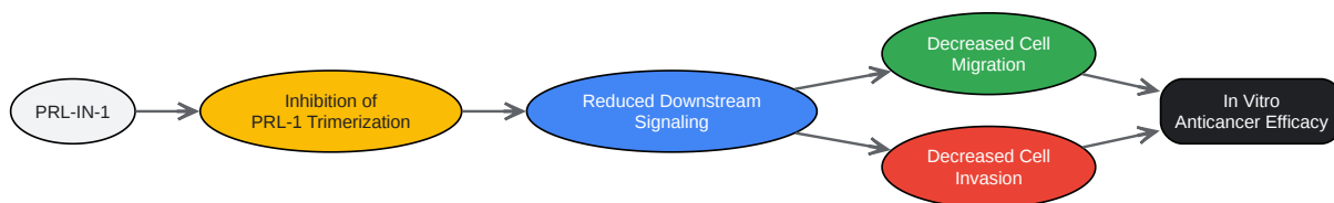
Caption: Workflow for in vitro efficacy testing of PRL-IN-1 .

Click to download full resolution via product page