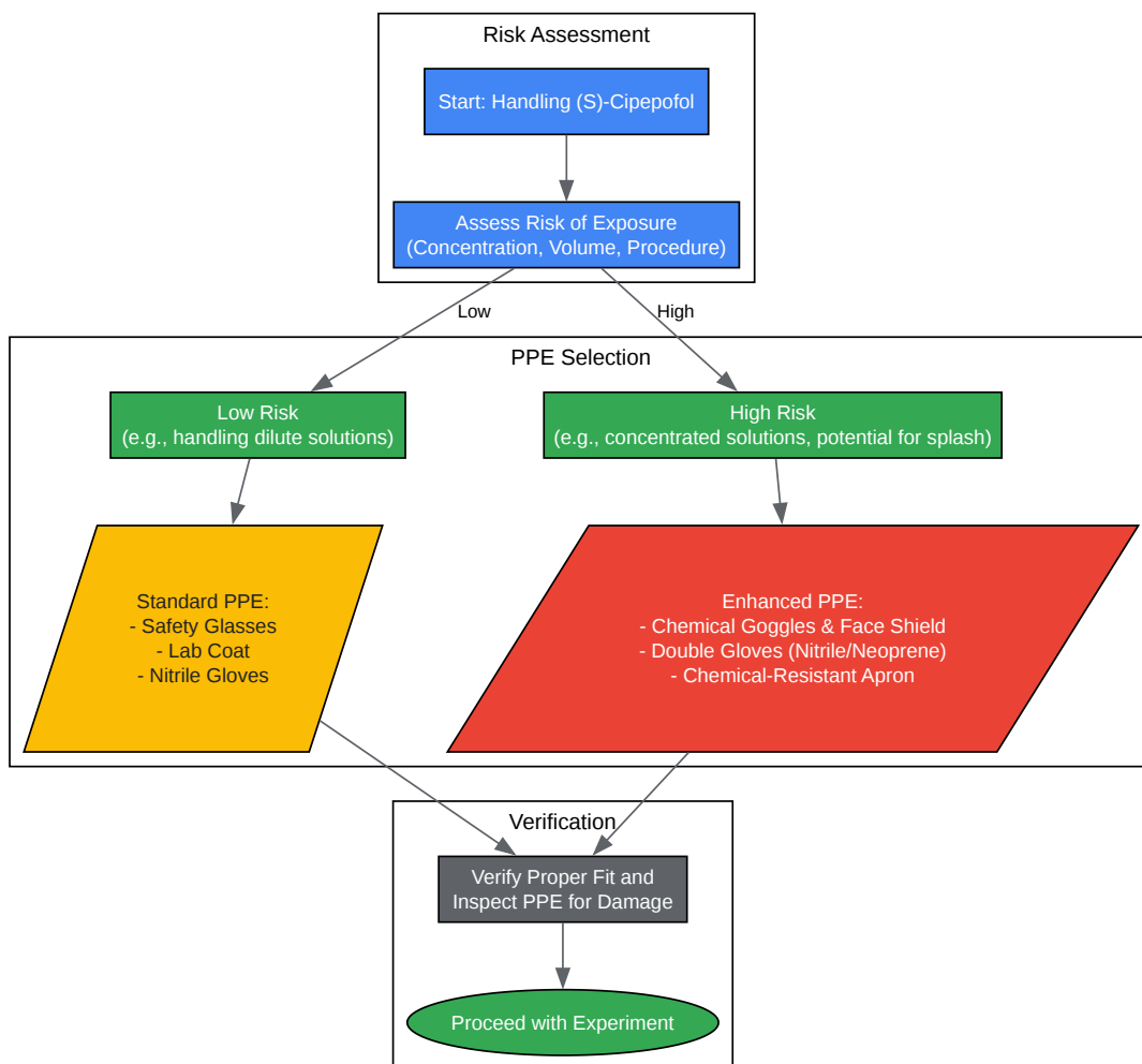
Diagram 1: PPE Selection Workflow for (S)-Cipecpofol Handling

Click to download full resolution via product page