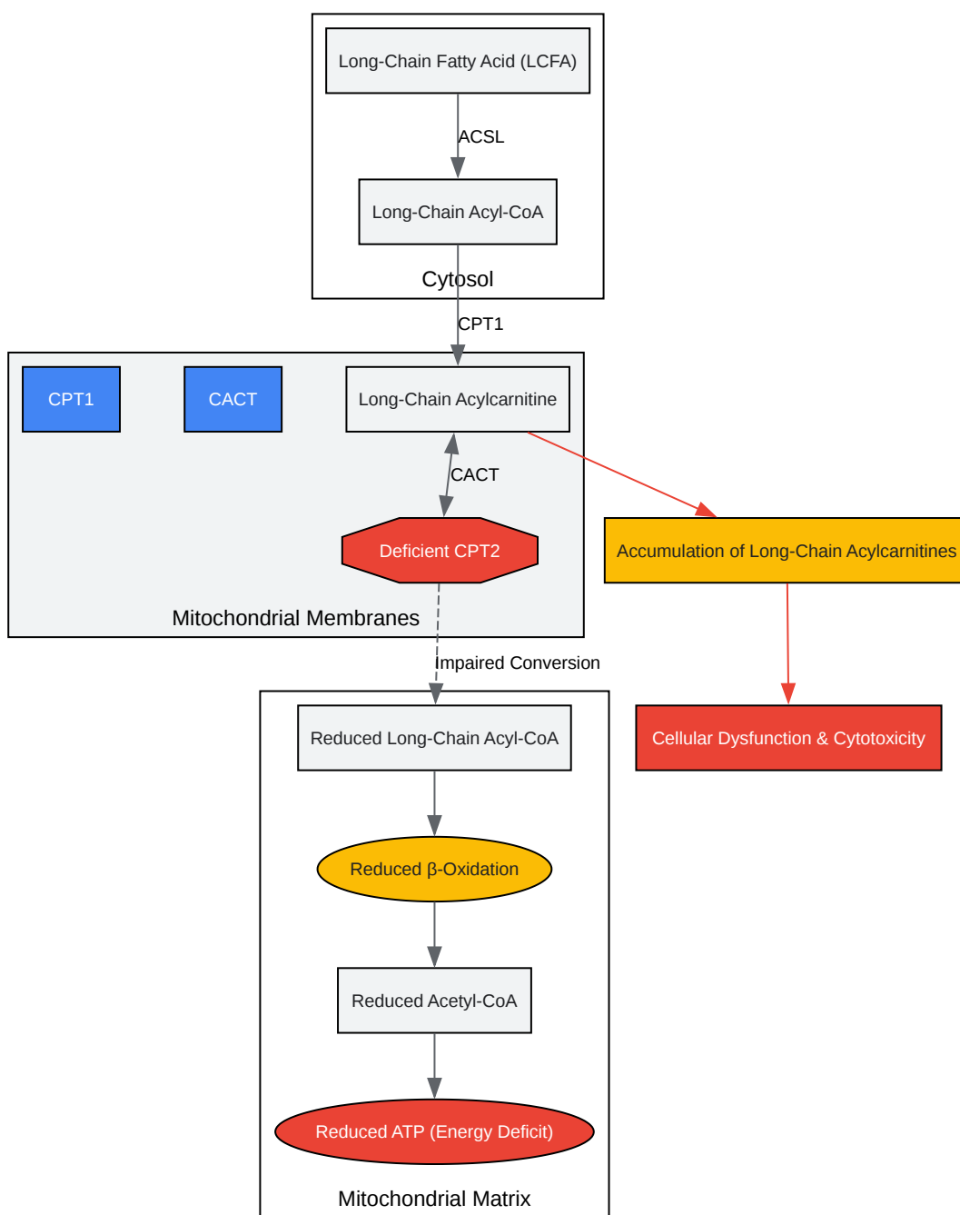
Figure 2: Pathophysiology of CPT2 Deficiency

Click to download full resolution via product page