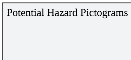
Diagram 1: Potential GHS Pictograms for Reactive Dyes

Click to download full resolution via product page