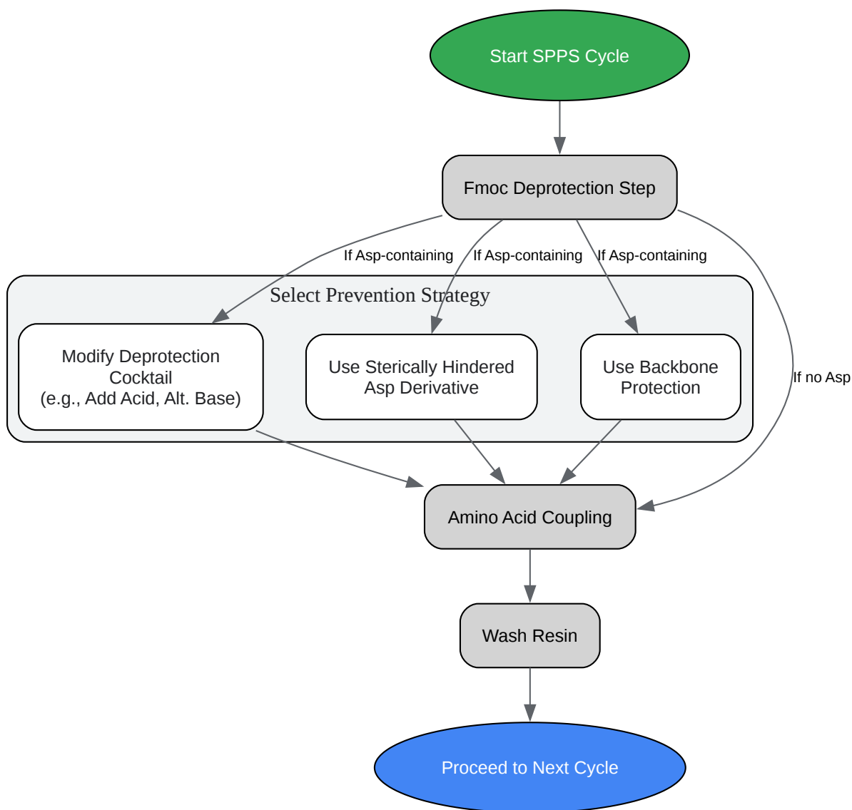
Caption: Mechanism of aspartimide formation.

Click to download full resolution via product page