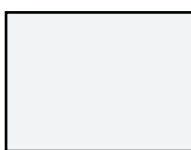
Chemical Structure of CalFluor 647 Azide

Click to download full resolution via product page