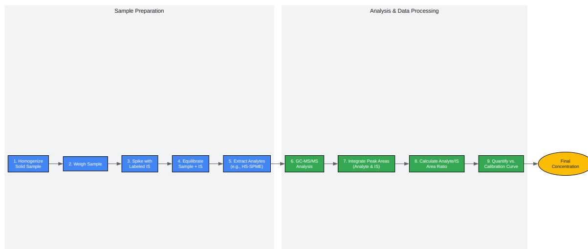
SIDA Experimental Workflow for 2-AP Quantification

Click to download full resolution via product page