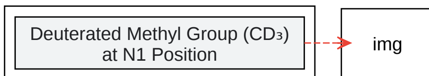
Chemical Structure of 1-Methylguanosine-d3

Click to download full resolution via product page