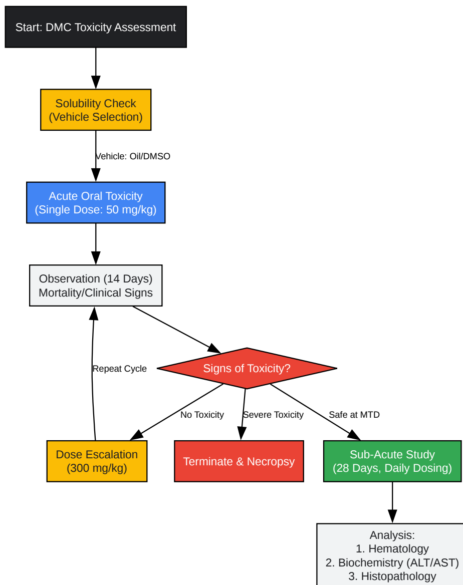
Figure 2: Step-wise Decision Matrix for DMC Toxicity Evaluation (OECD 423/407 adapted).

Click to download full resolution via product page