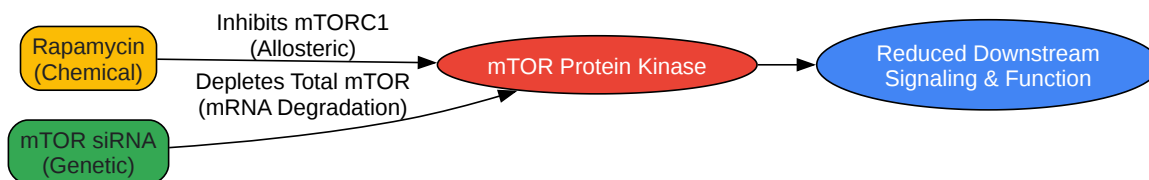
Caption: A generalized experimental workflow for comparing the effects of Rapamycin treatment versus mTOR siRNA knockdown on cultured cells.

Click to download full resolution via product page