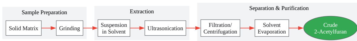
Figure 1. General workflow for Solvent Extraction of 2-Acetylfuran post-synthesis.

Click to download full resolution via product page