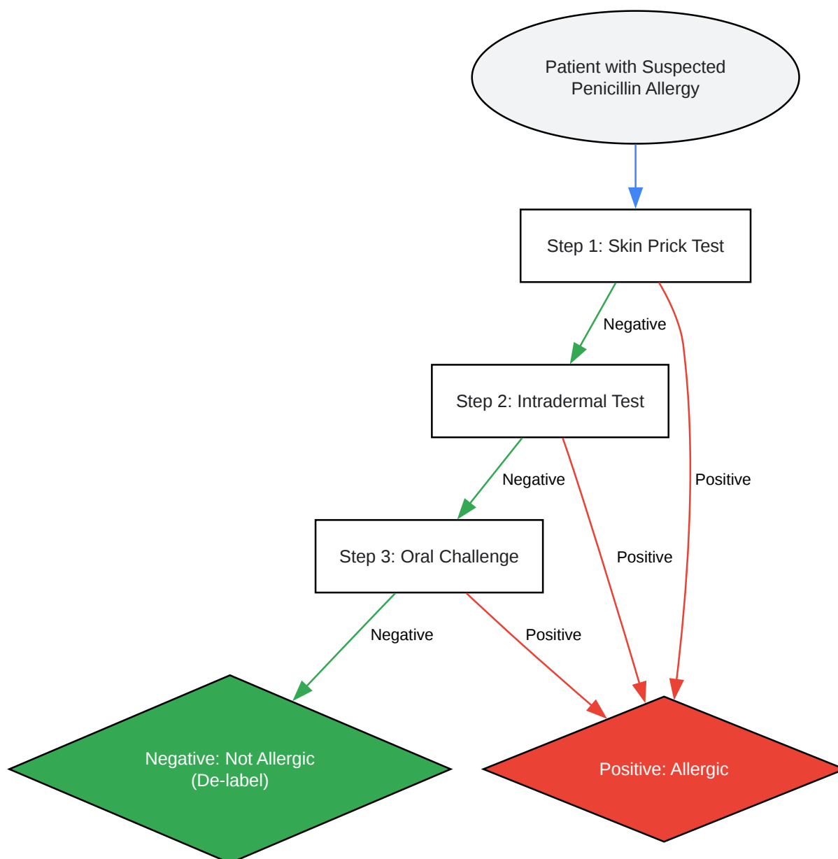
Caption: Signaling pathway of penicillin's mechanism of action.

Click to download full resolution via product page