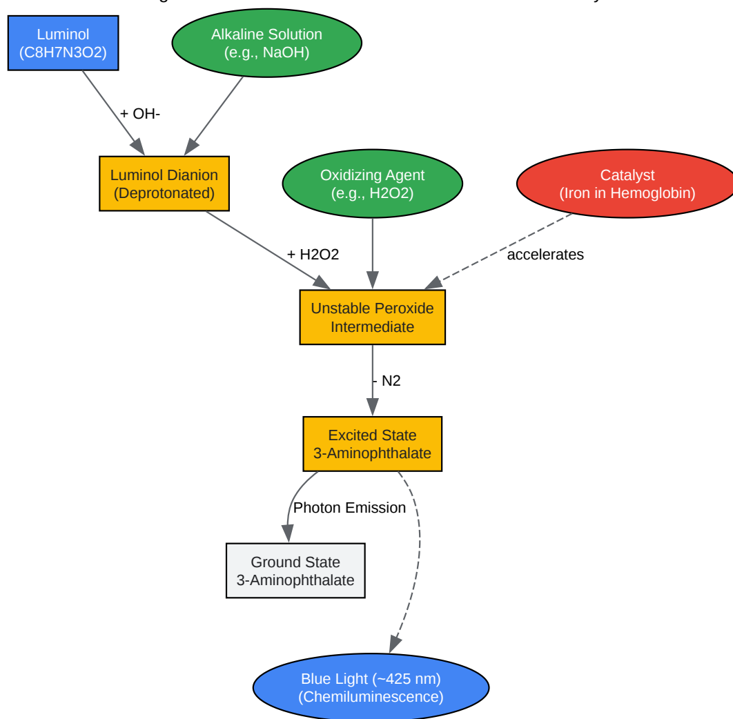
Figure 1: Luminol Chemiluminescence Reaction Pathway