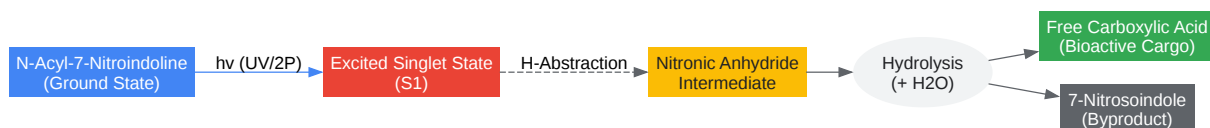
Diagram 1: Photocleavage Mechanism

Click to download full resolution via product page