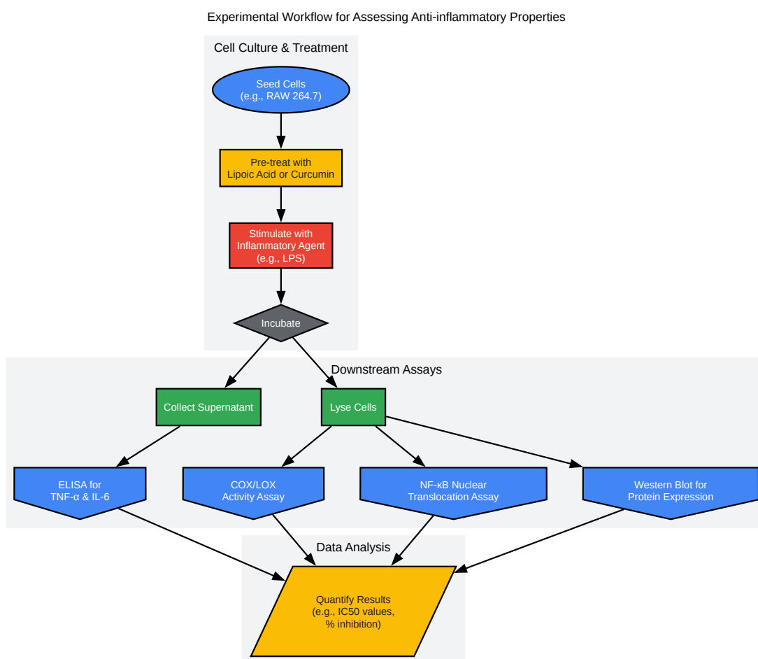
Figure 1: Simplified signaling pathway illustrating the anti-inflammatory mechanisms of Lipoic Acid and Curcumin.