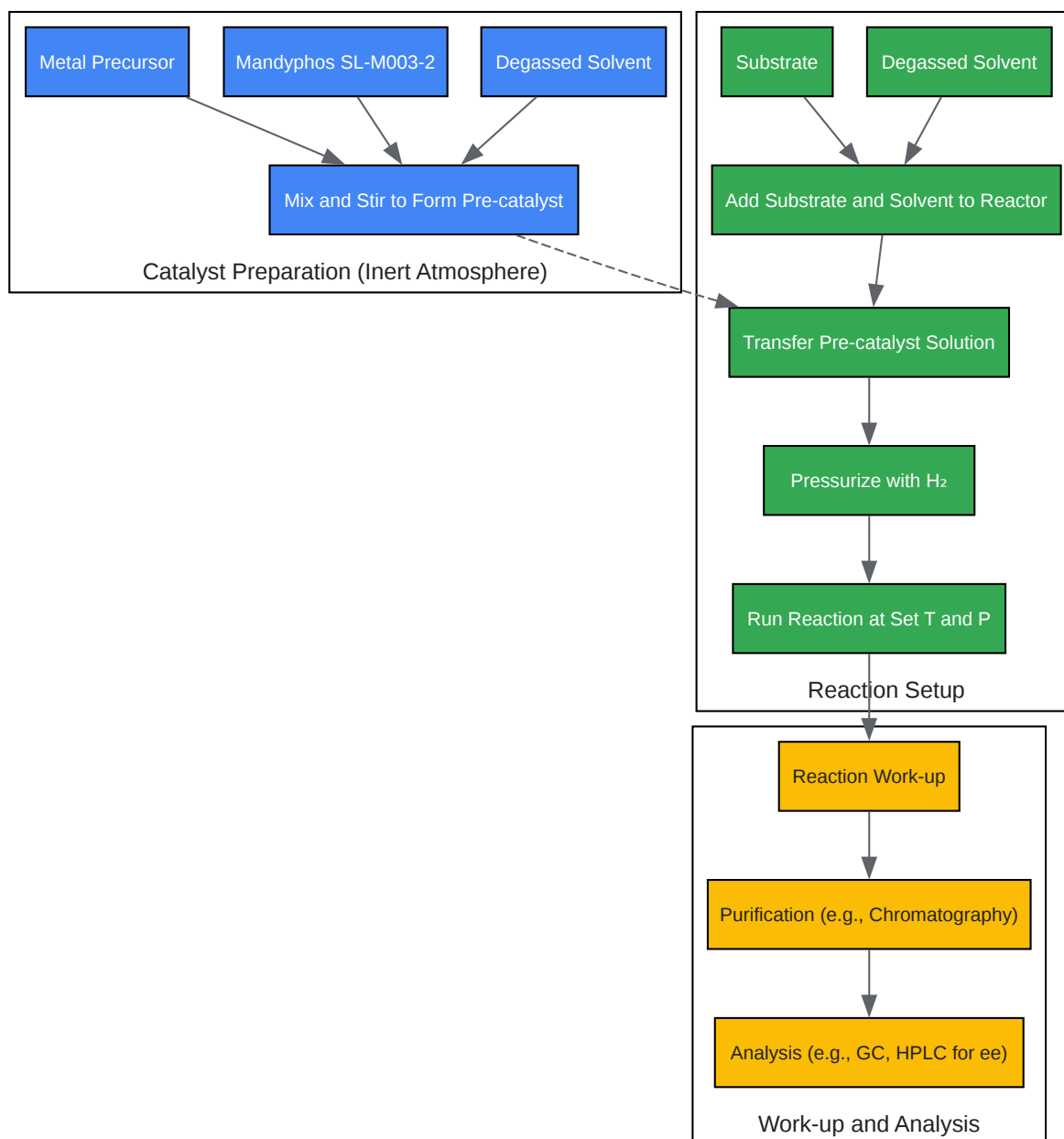
Figure 1: General Experimental Workflow