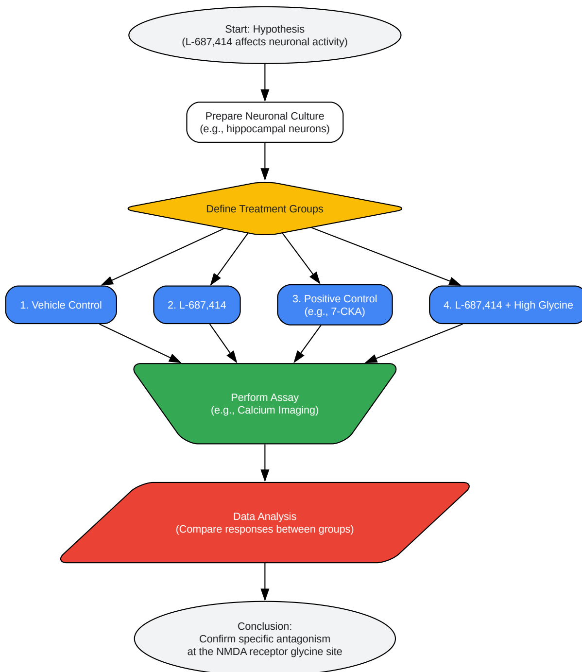
Caption: NMDA Receptor Signaling Pathway and Site of L-687,414 Action.

Click to download full resolution via product page