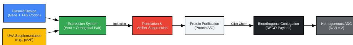
Figure 1: Site-Specific Conjugation Workflow

Click to download full resolution via product page